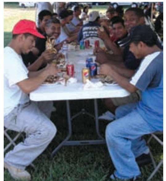
Colonial employees enjoying the crabs