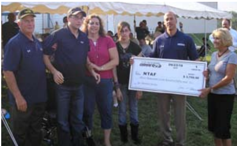
The Kesler and Katski families all stand for the check presentation